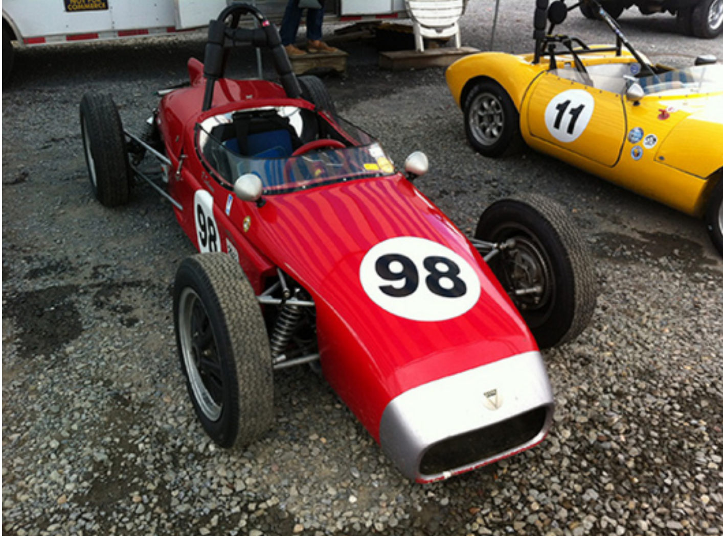
Nicely prepared '200' series ELVA Formula Junior at Watkins Glen