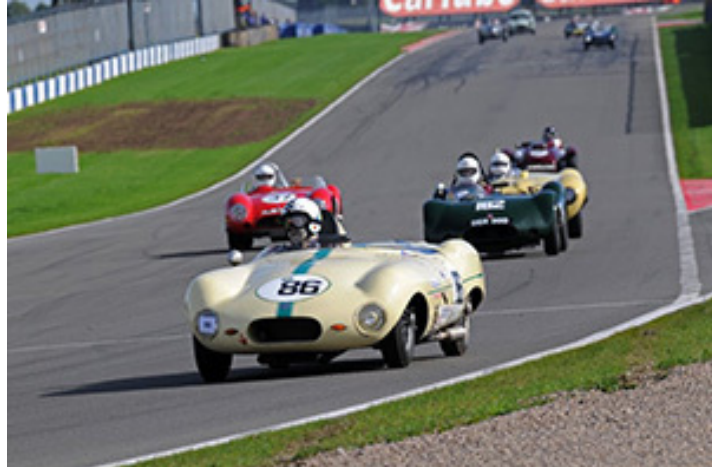
Ralf enjoying Donington Park in the Mk.III 100/46

Still thinking of that special Poster/Print then order soon for an extra happy Christmas? Info at ... http://www.elva.com/forum/viewtopic.php?f=3&t=291&p=843#p843 http://www.elva.com/forsale/eagle-print.php